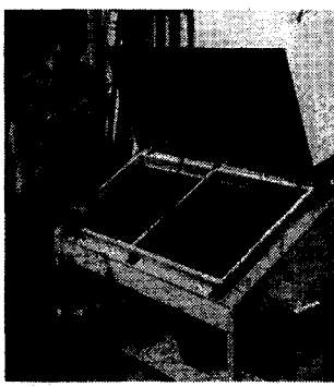
Group ULOG has distributed thousands of solar box and parabolic cookers, including this model

Responses came from solar cooking promoters in 67 different countries, including 18 in India, 12 in Nigeria, 11 in Kenya, 11 in Uganda, 10 in Tanzania, nine in South Africa, six in Nepal, six in Haiti, and five each in Argentina, Nepal, Mali and The Gambia. Continued on page 2