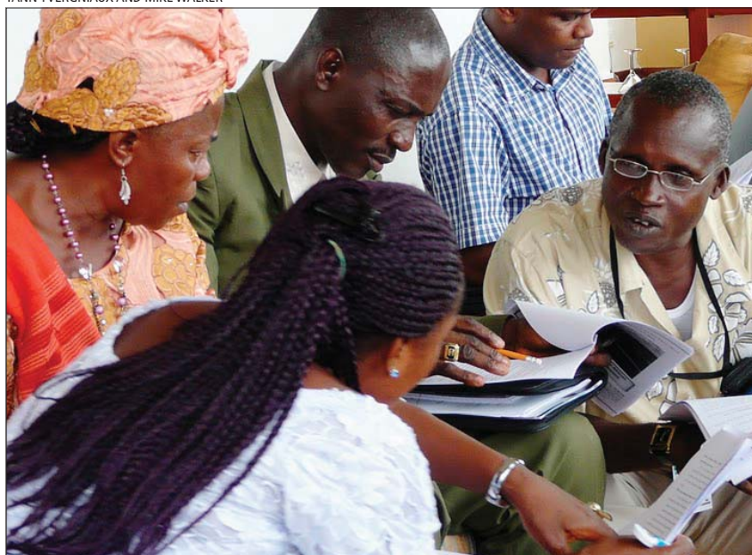
Representatives from Liberia and Sierra Leone discussing the contents of the Banjul Declaration, made on 21 September 2010 in Banjul, The Gambia